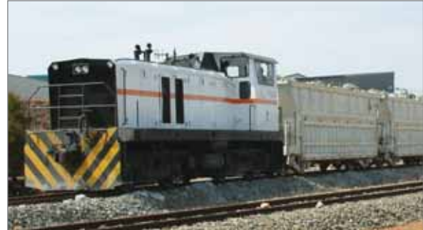
QSK19 powered locomotive in South Africa